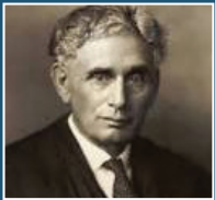
Louis Brandeis Supreme Court Justice from 1916 to 1939

“Those who won our independence believed liberty to be the secret of happiness and courage the secret to liberty.”