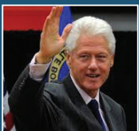
William Jefferson Clinton 42nd President of the U.S. (1993 to 2001)

“There is nothing wrong with America that cannot be cured by what is right with America.”